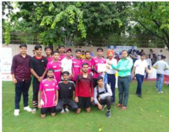
Students of Department of Mechanical Engineering, IIMT College of Engg at Tournament